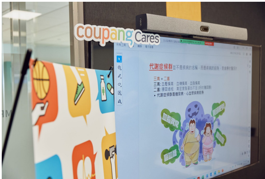
Coupage 2025. 7. 14.

Coupage 2025. 7. 14. Coupage 2025. 7. 14. Coupage Care Program